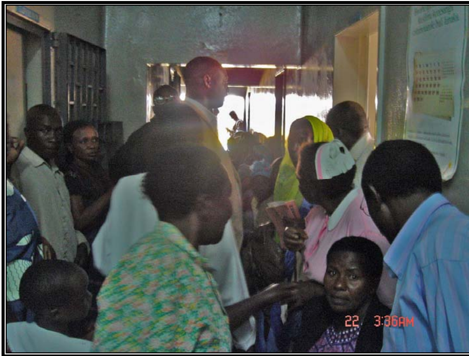
Figure 2, patients waiting to be seen