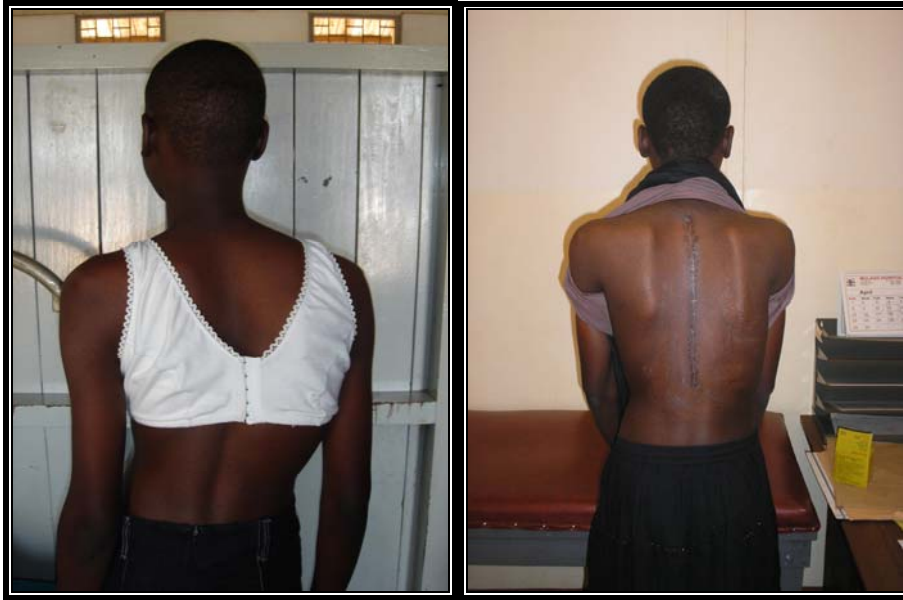
Figure 8, 17 year old female with Idiopathic Scoliosis, pre-op, 2 weeks post-op