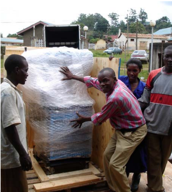
Figure 7, delivery of anaesthetic machine