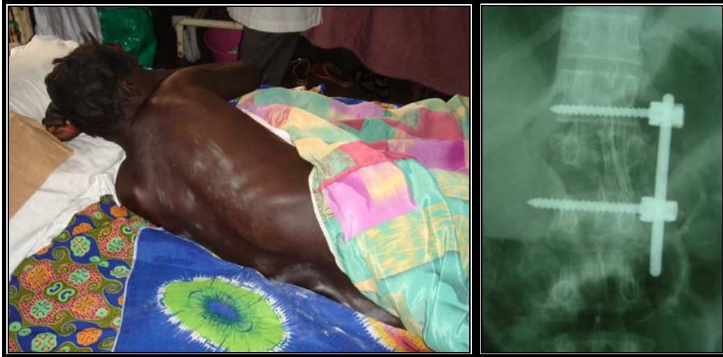
Figure 6, 30 year old female with L1 burst fracture with paraparesis, pre-op condition, post-op x-ray